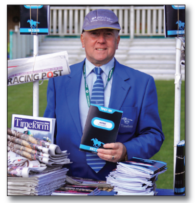
There are plenty of opportunities to pick up a Racing Post or form guide.