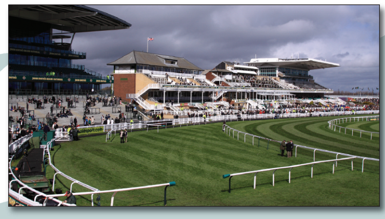
Right: The huge overhanging roof of the Earl of Derby Stand juts out prominently on the left.