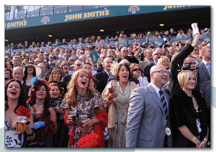
As the riders approach the finish, excitement levels are raised to new heights.