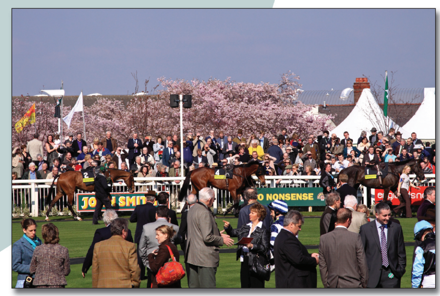
Parade ring. This is a glorious sight in the spring sunshine, with the blossom out on the trees behind the grassy bank which makes a perfect viewing area.