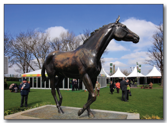
Red Rum. This world famous racehorse was the only one ever to win the Grand National three times.